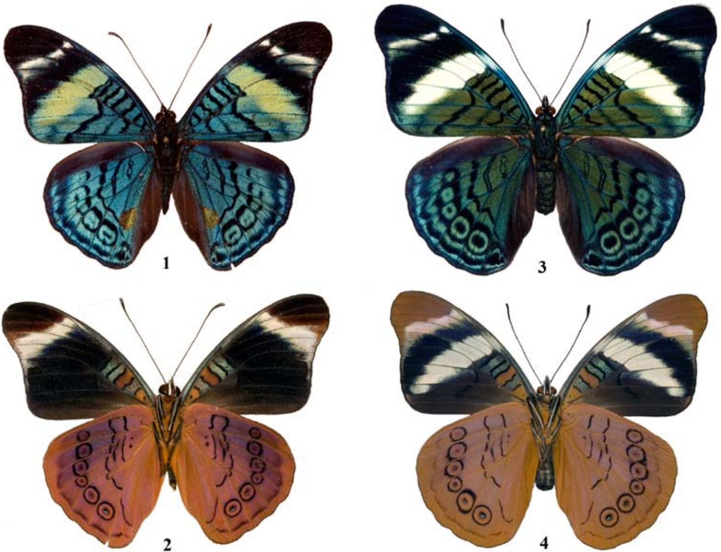
Figs. 1-4. Adults of Panacea procilla lysimache from El Bosque Nuevo property, Guanacaste Province, Costa Rica. 1, male, dorsal view. 2, male, ventral view. 3, female, dorsal view. 4, female, ventral view.

are produced. Similar to fifth in morphology except noticeably larger in size and more yellow-orange in color.